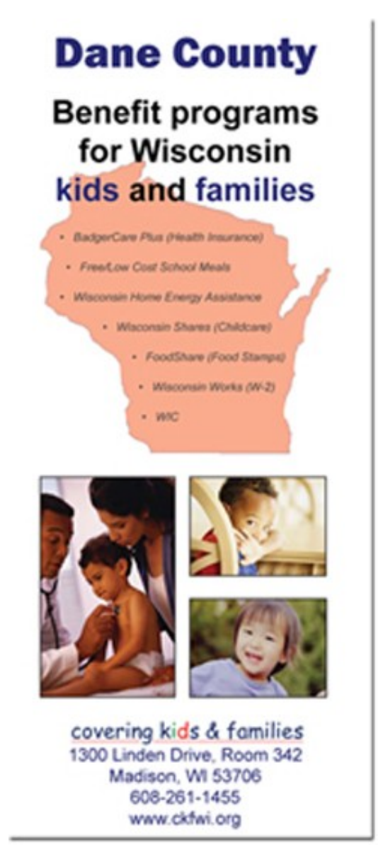
Figure 2. MAP Publication

Tools for Schools and Communities: An Online Toolbox for Enhancing SCHIP Outreach and A&/a@fn@ss6:18:27